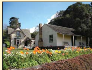
Huia Lodge and Acacia Cottage

The exhibitions, display and activities are held at the Cornwall Park Information Centre (Huia Lodge). Open daily from 10am-4pm. Closed Christmas and Boxing Day. Music concerts may be postponed due to rain. Please call the Information Centre for new date. The guided walk will proceed except in very heavy rain, bookings essential and a reasonable level of fitness is required.