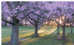
Lesley Abell – First equal